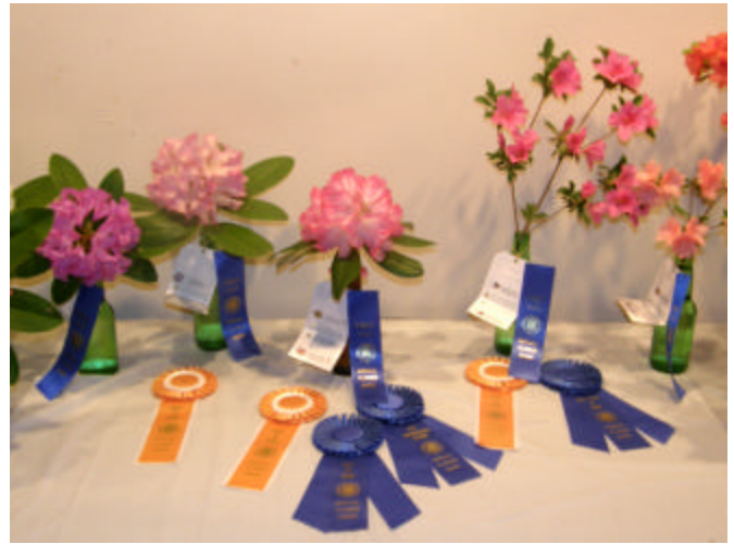
2008 Flower Show Winners

Examples: 'Glacier', 'Ben Morrison', 'Coral Bells', 'Quakeress', 'Pink Pearl', 'Dream', 'Nancy of Robinhill'