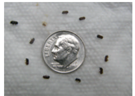
Asian Ambrosia Beetles

Then put some soapy water in the bottom of the soda bottle since that will trap the insects as they fly into the trap, and fall to the bottom. Check the traps often for insects.