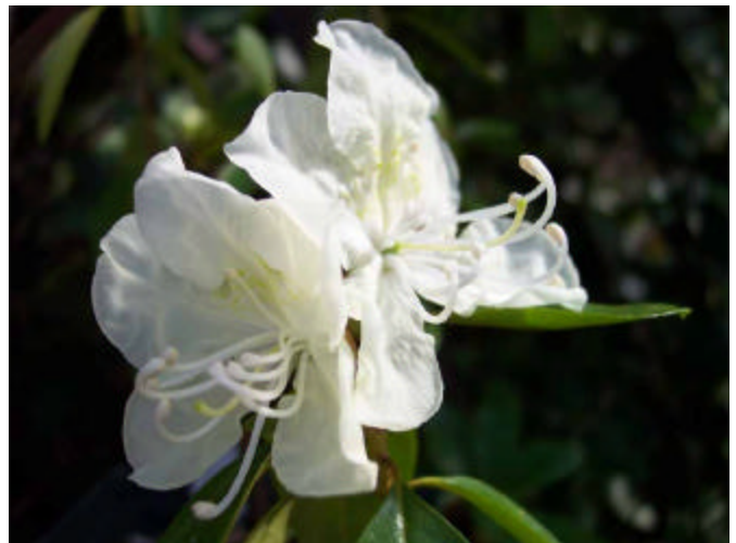
R. dauricum album – A hardy species from Siberia