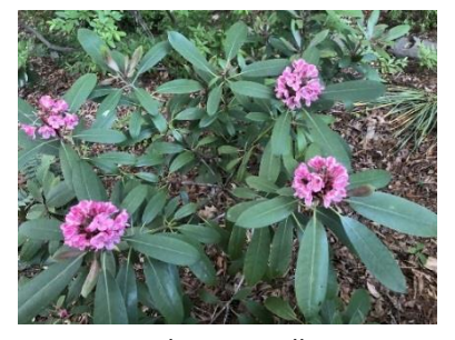
Red Max Seedling

I was thrilled three years ago when the Red Max bloomed, with trusses of both white and red. Last year it produced seven red trusses. This year