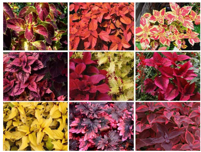
Some Colorful Coleus Varieties