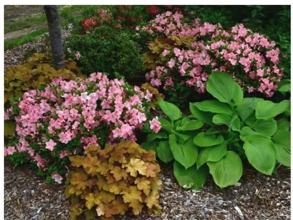
Encore ® Autumn Debutante