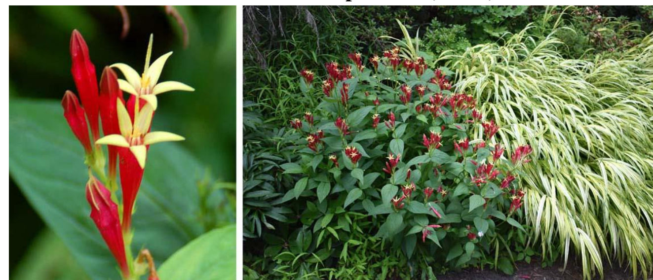
Spigelia marilandica and Variegated Hakone Grass

These are native plants that can provide brilliant red color to the summer garden. Although not deer proof, they are deer resistant in my garden. I do shake garlic powder on emerging shoots to discourage browsing. Bambi will taste anything.