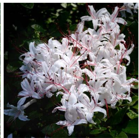
R. arborescens var. georgiana