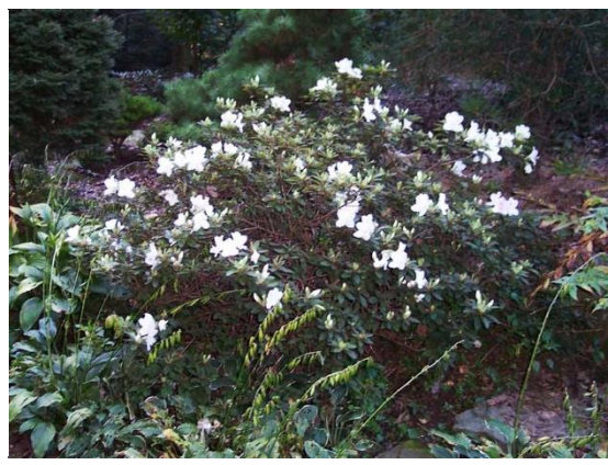
'August to Frost' plant

There are some native azaleas that flower in late summer into fall. The red R. prunifolium is wonderful and so is R. arborescens var. georgiana. Hybrids of the two are usually lovely pinks!