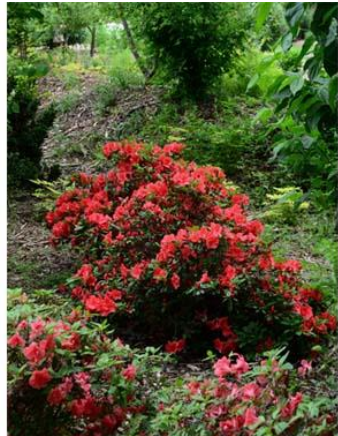
Encore ® Autumn Bonfire