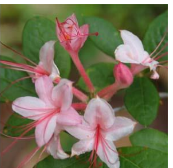
Hybrids of R. prunifolium and R. arborescens var. georgiana