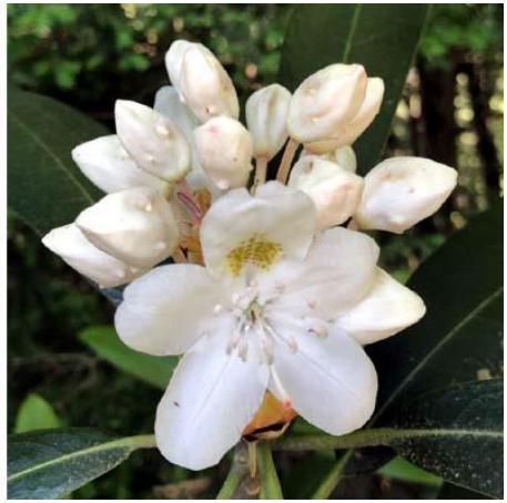
Color Variations of R. maximum