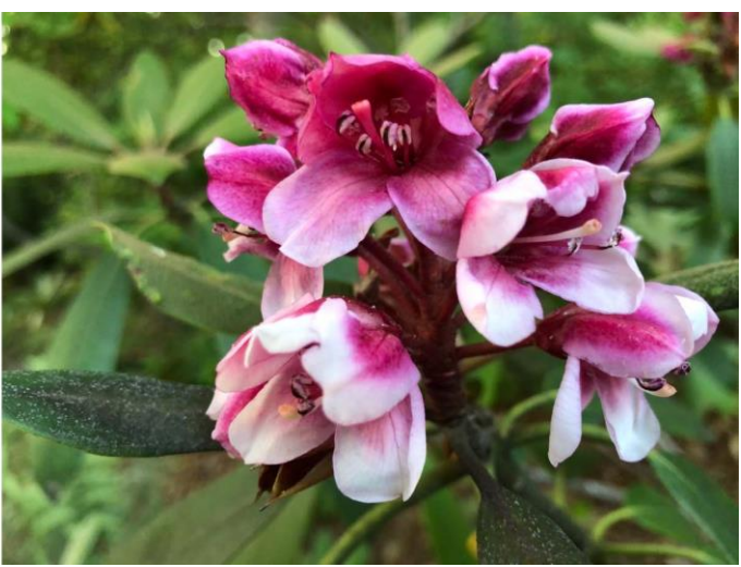
Truss of Red Max Seedling – Red and White