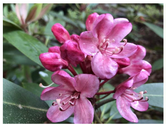
Truss of Red Max Seedling - All Red

the last two years, but the flowers are not as striking as the Red Max. My 'Mt. Mitchell' has beautiful dark green foliage but has not bloomed. Some years ago, a seedling grew in the moss in my woods with no help from me. It has been blooming for several years and it clearly has R. maximum as a parent.