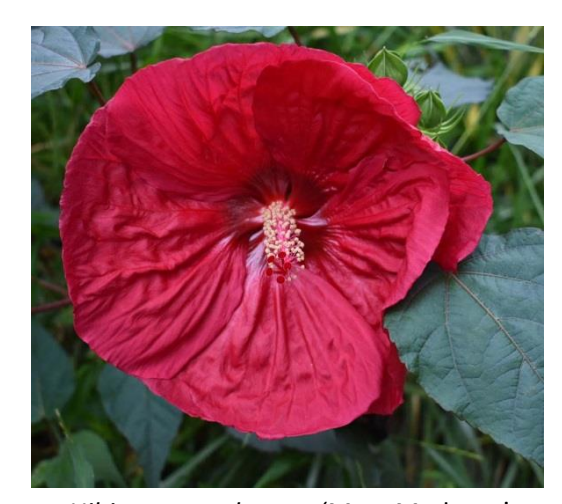
Hibiscus moscheutos 'Mars Madness'

I love the tall, stately red spikes of my Cardinal Flower, Lobelia cardinalis . The hummingbirds love them, too.