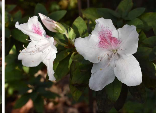
'August to Frost' variant with red blotch

'August to Frost' is not a rebloomer. It only flowers in the late summer through the fall on new growth. It stops blooming when a freeze kills developing buds so there are no blooms next spring.