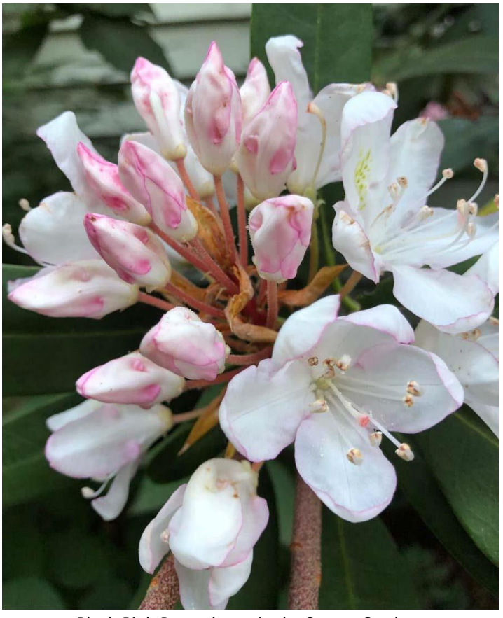
Blush Pink R. maximum in the Segree Garden

Interesting! I can't wait for next year! 'Midsummer Red Max' has bloomed