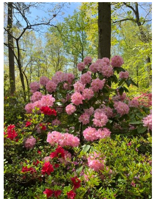
(Scintillation x Apritan)