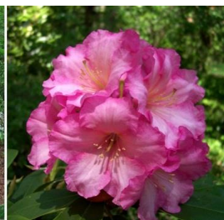
'John C. White'