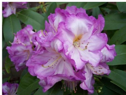
'Gilbert Myers'